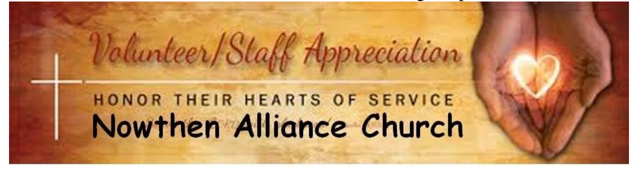
Sunday June 4, 2017, from 9:30am - 10:45am in the Koinonia Kafe.

hands to the needy. Her family is clothed in fine linen and she sells the excess of her labor to benefit her loved ones. She is clothed with strength and dignity; she can laugh at the days to come. She speaks with wisdom, and faithful instruction is on her tongue. She watches over her household and does not eat the bread of idleness. Her children arise and call her blessed; her husband also, and he praises her: 'Many women do noble things, but you surpass them all.' Charm is deceptive, and beauty is fleeting; but a women who fears the Lord is to be praised. Honor her for all that her hands have done, and let her works bring her praise!"